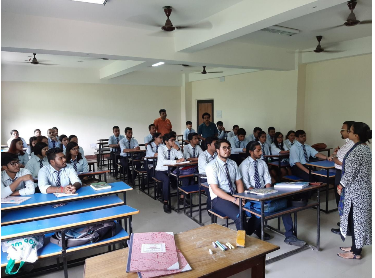
BBA 5 th semester