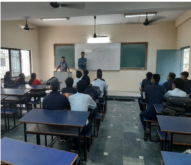
Figure 3: Talk with 2nd year students