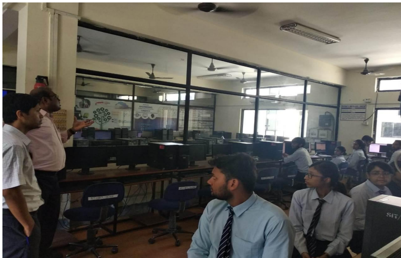
3 rd Year CSE Group B