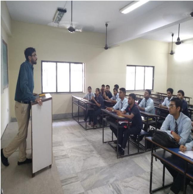
Figure 1: Talk with 3rd year student