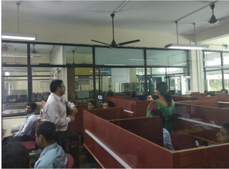
3 rd Year CSE Group A