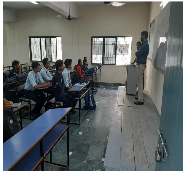
Figure 4: Talk with 2nd year students