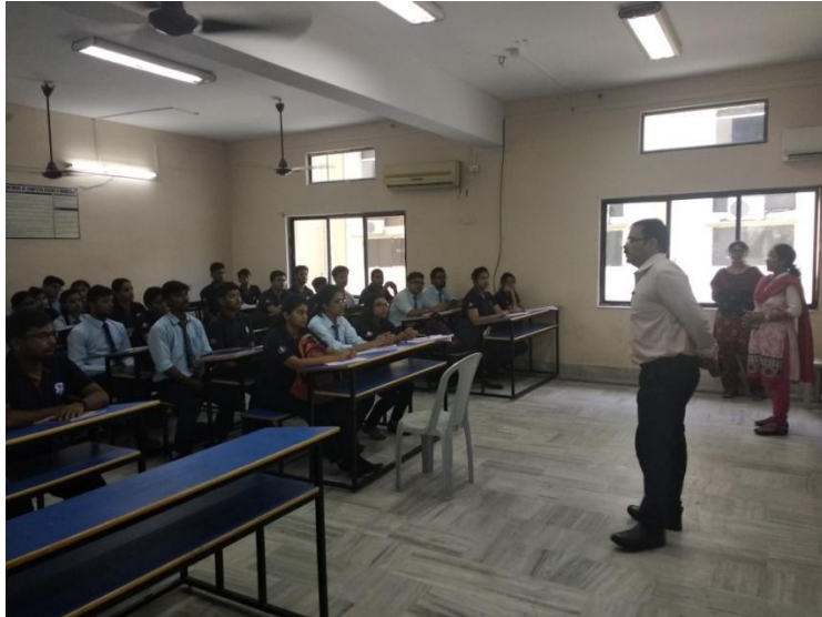
2nd Year CSE Group A