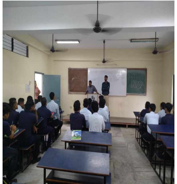
Figure 2: Talk with 3rd year student