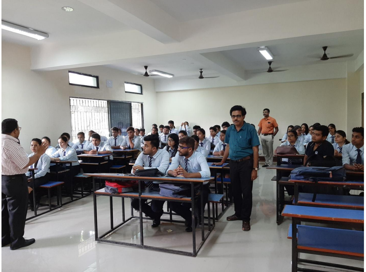
BBA 3 rd semester section A