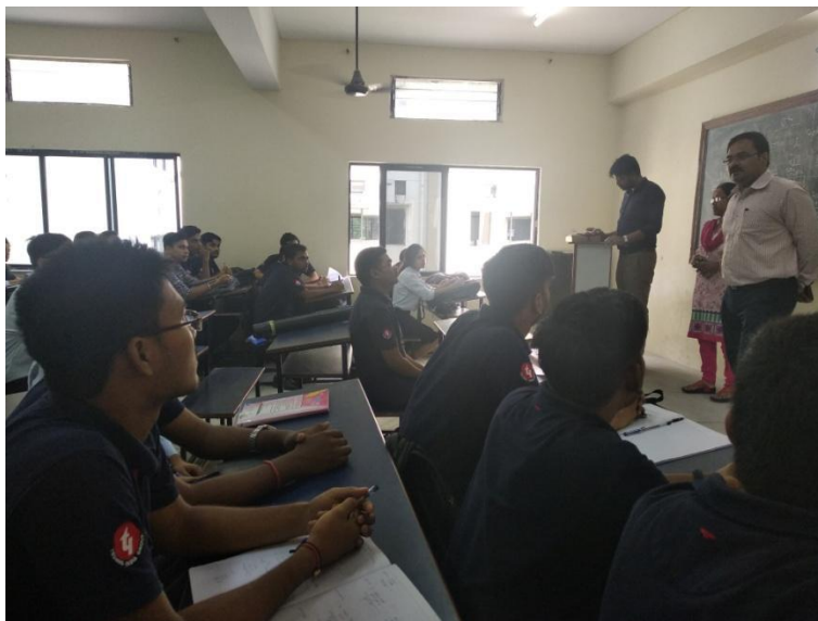
2 nd Year CSE group B